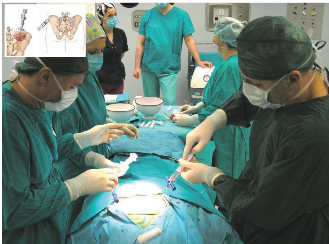
Figure 1. Stem cell collection from G-CSF primed BM by aspirations

Bone marrow derived stem cells. Historically, BM was the first source for SC transplants (BMT). Cells were collected by multiple aspirations from the iliac crests, under sterile conditions, while the donor was generally anesthetized (Figure 1).